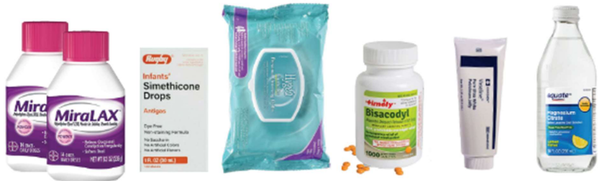
2 MiraLAX (Laxative)