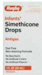
Simethicone Drops (Antigas)