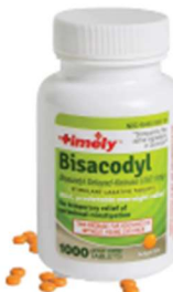
Bisacodyl Tablets (Laxative)