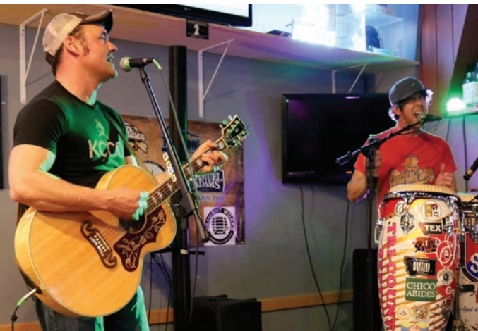
(above) The Wench performed at the 221 Children's Fund event, which raised more than $10,000.